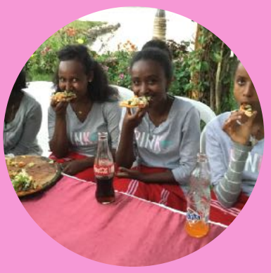
12th grade stress relief event